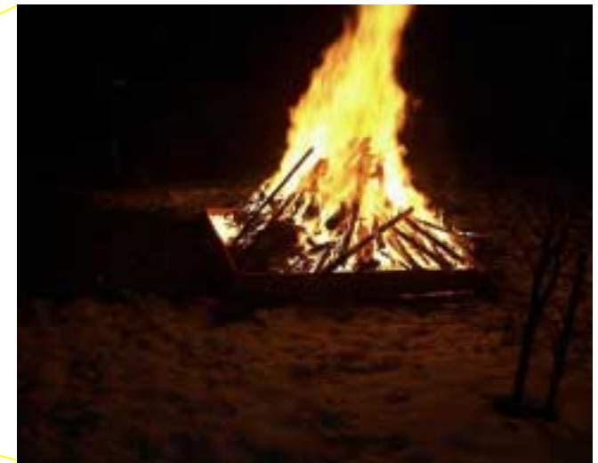
On-ground image of the test fire: Size = 2 \times 2 \text{ m}^2 Max. temperature = 930-990 K Energy release < 0.17-0.22 MW