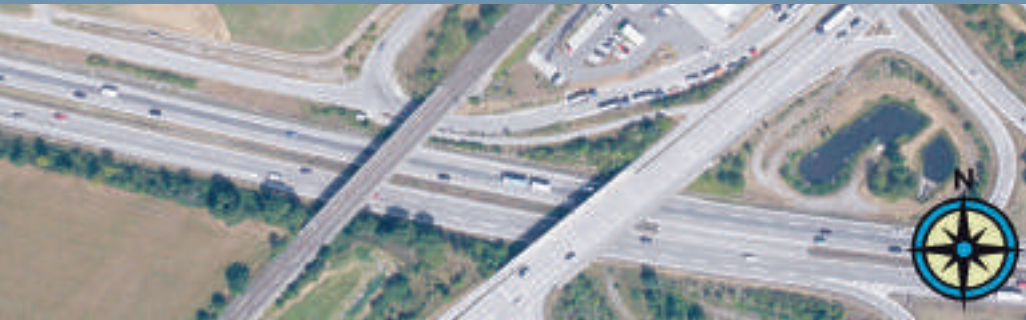
Section of an aerial image taken from an altitude of 2 kilometers with DLR's own 3K camera system: Highway A96 with the exit north of the DLR branch in Oberpfaffenhofen