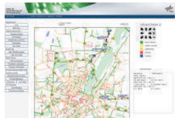
DELPHI combines traffic and crisis management. A web portal supports networked decision-making between the various responsible parties.

Federal highways and city roads is integrated and combined with Floating Car Data (so-called FCD) and traffic parameters provided by aerial images from ARGOS. Sensors carried by the plane provide images of highly sensitive road sections or roadway systems with a resolution of up to 15 centimeters. They fill up the data gaps for routes without other detectors, for example, by collecting traffic-relevant parameters such as the number, location and speed of vehicles. Based on these high resolution images, emergency services receive an overview of the current road situation and the area surrounding an incident in the DELPHI portal. This enables decision-makers to better manage operations.