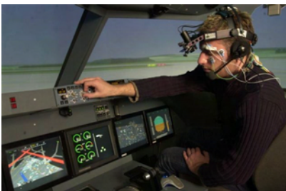
Figure 1: MOSES experiment at DLR's generic cockpit simulator GECCO.

How does pilots' gaze in the cockpit change if an additional taxi guidance system is used?