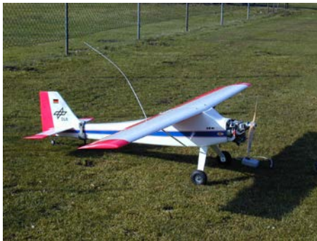
Fig.2: MAL UAV