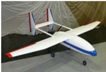
Fig. 1: Prometheus UAV