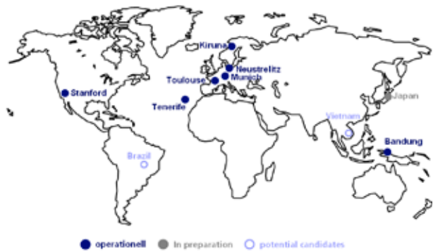
Current status of EVnet sensor station implementation (spring 2007)