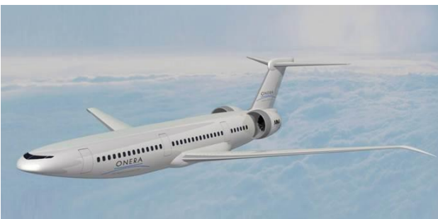
A possible candidate for 2035 air transport: ONERAs NOVA concept with semi-buried engines (@ ONERA, 2015)

Finally, the new concepts will be assessed with the technologies needed for the best noise reduction.