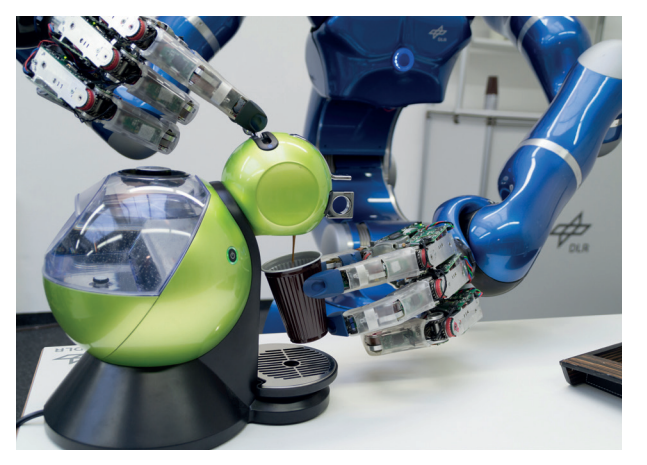
The control algorithms allow Rollin' Justin to sensitively interact with the environment. Feeling contact forces, detecting collisions, and active "softening" are key features to meet the challenges of domestic environments.

In other words, important tasks are always accomplished, and less important tasks are performed as well as possible without affecting the more important ones.