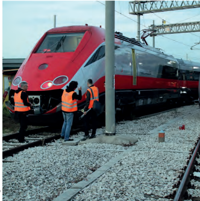
The two Frecciarossa high-speed trains are 328 metres long and can travel at speeds of up to 360 kilometres per hour. In their noses, the scientists installed measurement antennas and a proximity radar to accurately determine the distance between the two trains and exchange information between them.

Like number 7, in whose nose the antenna for the radio channel characterisation has just been mounted, number 28 is also an Italian high-speed train – a Frecciarossa (Red Arrow). Tonight, these two trains are neither occupied by passengers nor waiting to be cleaned in the depot, which would be more usual at this time of day – they are occupied by an 11-person team from the DLR Institute of Communications and Navigation. The scientists are using the two high-speed trains to study train-to-train communication during their journey. The high-speed line between Rome and Naples provides the team with 206 kilometres of track to conduct investigations during nocturnal test runs. The researchers want to find out how the exchange of information between two trains travelling at full speed can be made reliable enough for train control purposes. In preparation for the measurements, Unterhuber travelled to Naples and Vicenza beforehand and equipped the measurement trains: four antennas on the roof of train number 28, two antennas on train number 7 and no less than 150 metres of measuring cable straight through carriages and locomotives. Five more antennas have to be installed tonight.