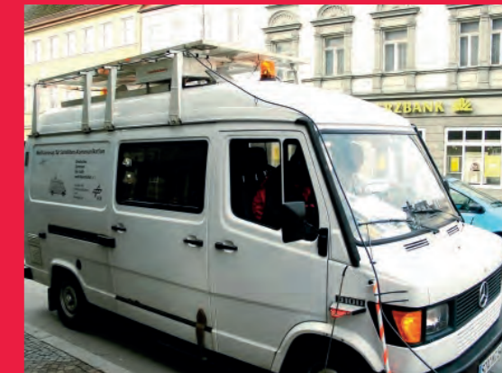
In 2002, DLR researchers investigated the radio channel between a measurement bus and a Zeppelin using the Channel Sounder.

For 15 years, the Channel Sounder has been a proven measurement instrument for researchers at the DLR Institute of Communications and Navigation. In the Roll2Rail measurement programme in Italy in 2016 it proved its worth once again: scientists gathered valuable information about the characteristics of the radio channel in train-to-train communication.