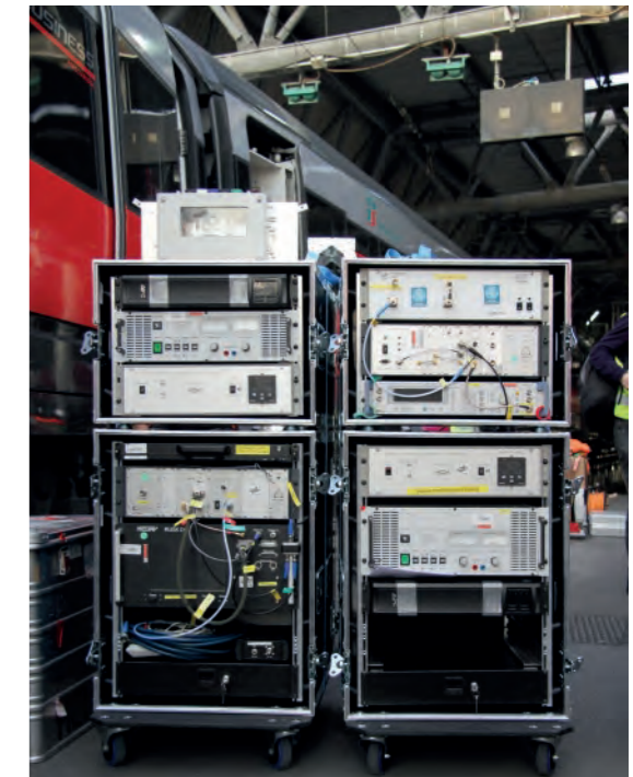
The Channel Sounder consists of a transmitter and a receiver unit. The receiver reveals how the radio signal is reflected by the environment.

For four nights, the DLR researchers investigated wireless train-to-train communication in and between two high-speed trains in Italy. The Italian partner Trenitalia made two Frecciarossa high-speed trains available to them. The measurements were carried out as part of the EU Roll2Rail project on the high-speed line between Rome and Naples. The measurements in Italy were carried out as part of the European Union (EU) Roll2Rail project. Roll2Rail is one of the lighthouse projects of Shift2Rail within the Horizon 2020 programme. Thirty-one European partners are working on the development of key technologies, increasing reliability in the railway sector and reducing costs. The Roll2Rail project has received funding from the European Union’s Horizon 2020 research and innovation programme under grant agreement No 636032. The project is closely connected to the DLR Next Generation Train project.