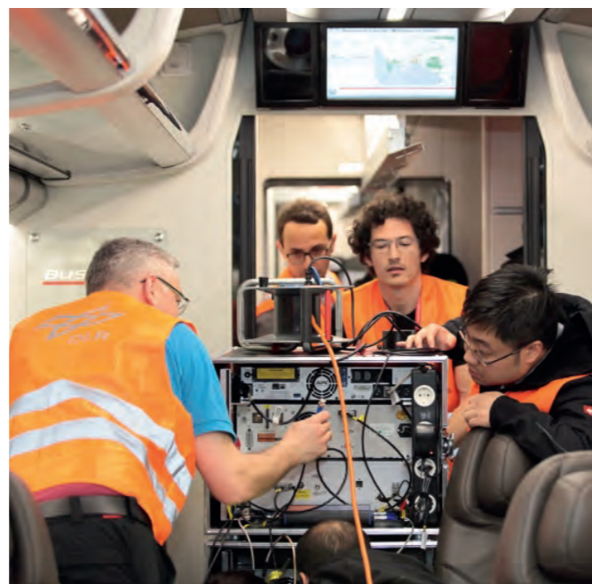
Care must be taken when the sensitive Channel Sounder is pushed into the train carriage.