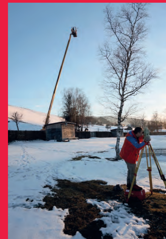
To measure the ground reflections of a radio signal emitted from an aircraft or a satellite, the scientists installed the Channel Sounder on a 40-metre-high crane during tests in 2014 and 2015.