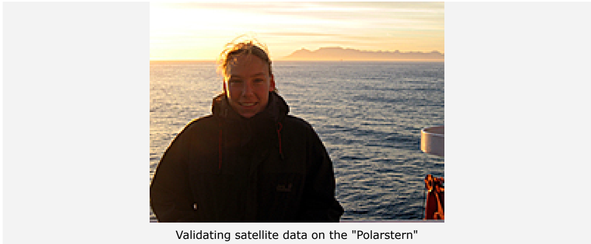
Validating satellite data on the "Polarstern"