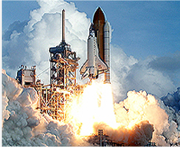
Launch of Space Shuttle Atlantis in September 2000