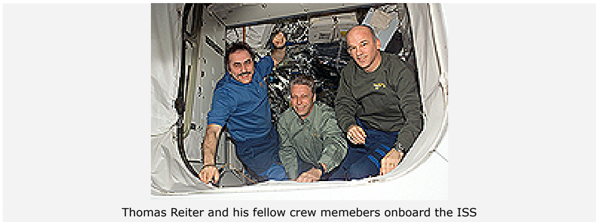
Thomas Reiter and his fellow crew members onboard the ISS

In April 2001, Italian Umberto Guidoni was the first European astronaut on board the ISS. In the summer of 2006, Thomas Reiter of Germany started a new chapter by setting off for the ISS as the first European astronaut to undertake a long-duration mission to the space station, spending almost six months on board in the context of the "Astrolab" mission in order to conduct more than 30 scientific experiments in addition to performing maintenance and service work. For the first time, European scientists were able to compile a research programme specifically designed to utilise the possibilities offered by the ISS, and to implement it over a longer period of time. Moreover, "Astrolab" was the first long-duration mission of ESA that was coordinated by the Columbus Control Centre at DLR in Oberpfaffenhofen.