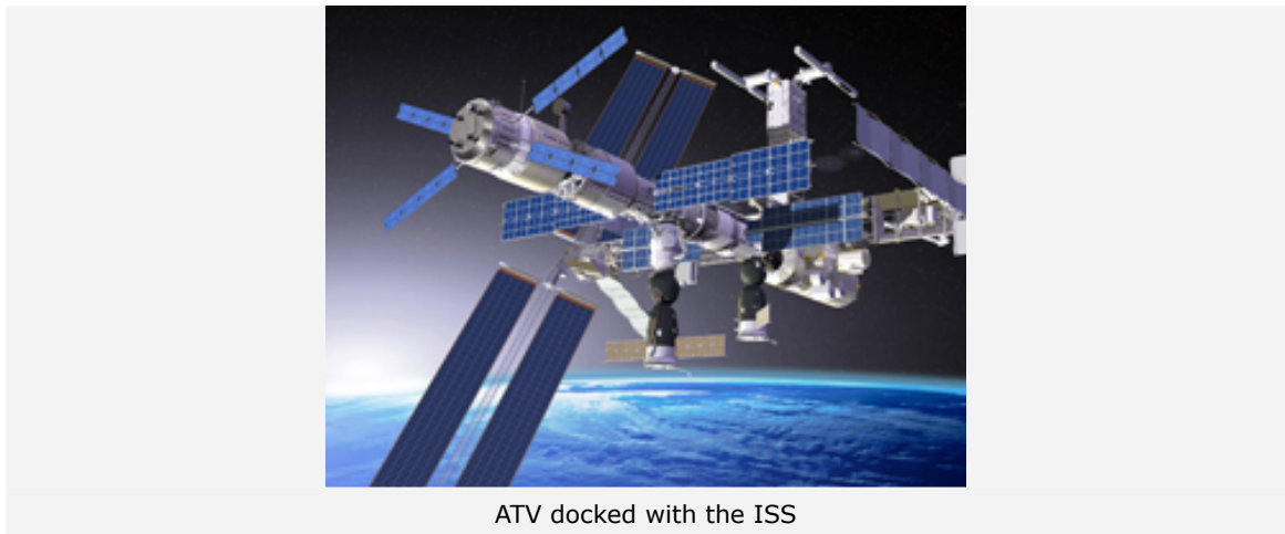
ATV docked with the ISS

completed. This was made possible not least by successful intergovernmental cooperation, both between DLR's Space Agency (DLR Raumfahrt-Agentur) and the ISS partners and between ESA member states.