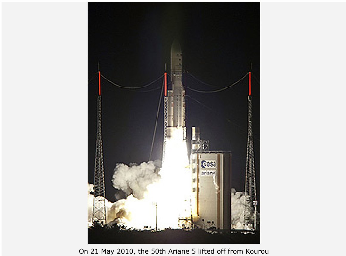
On 21 May 2010, the 50th Ariane 5 lifted off from Kourou