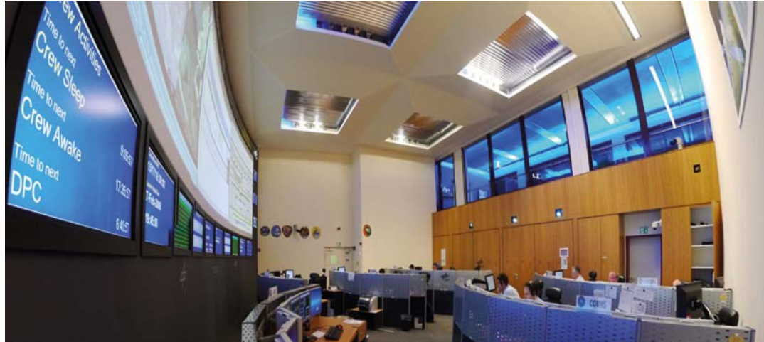
Fig. 2-1 Ground Operations Control Room (GoCR)

The German Space Operations Center has developed this course addressing all aspects of satellite operations and corresponding ground segment design. The course is intended for a maximum number of 18 participants and is held once or twice a year, usually in April and/or October.