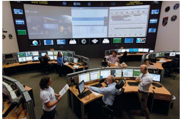
Fig. 3-2 Typical GSOC-OP mission control room (K4)

Our compact courses usually take place in two days and require little previous knowledge in the field of space operations. Nevertheless, participants should have a basic technical understanding of general space technology concepts. They get an overview of the necessary knowledge in the specific fields. In exercises and simulations, the participants work on console themselves. The guided tours and project visits put them in direct contact with the missions operated at GSOC.