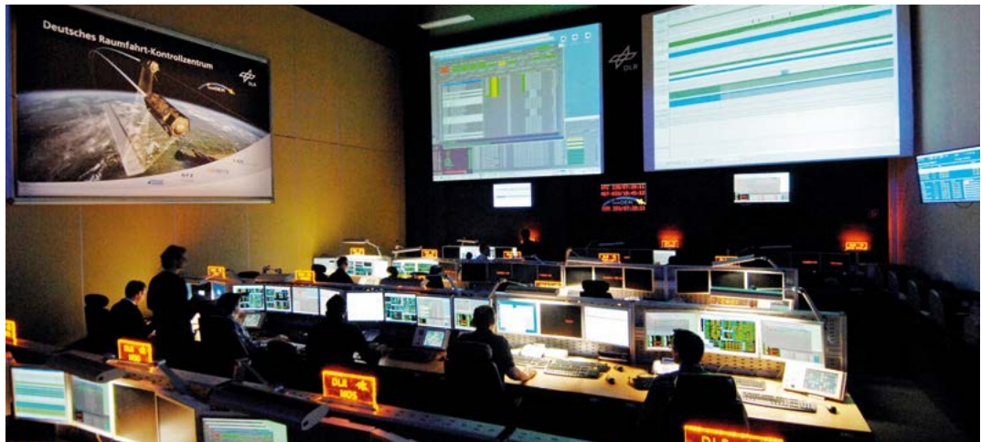
Fig. 3-1 Control Room K2 - Mission TanDEM-X

Based on the Spacecraft Operations Course we offer customized trainings. The format can be expanded or compressed; the depth can be adjusted from overview to detailed training. Some modules can be held at the customer's site and for a larger audience.