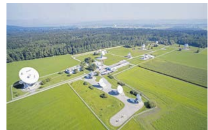
Fig. 2-3 Ground Station located at Weilheim