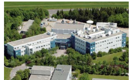
Fig. 2-2 GSOC, Oberpfaffenhofen

The Oberpfaffenhofen site of DLR is located approx. 25 km west of Munich, Germany. Please check the map for more details. Accommodation is available in the area around Oberpfaffenhofen or in downtown Munich. Attendees should make their own arrangements, but support is available.