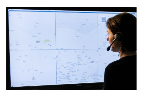
Validation trial using large UHD screens, especially suited for dividing the screen into several information areas

The fully functional simulation allows you to experience how sectorless air traffic control could be conducted and shows the advantages of such an aircraft-centred control concept. An even workload distribution and greatly reduced need for coordination allows controllers to work more efficiently and concentrate on their main task: conflict resolution. Additionally, controllers can work more flexibly and are no longer restricted by sector-licensing. This opens up new possibilities for contingency solutions. Since there are no handover points between sectors anymore, pilots can follow user-preferred routes and have the advantage of only one contact person during their entire flight. The overall concept allows for easy integration of new vehicle types with different flight perfomances, such as remotely piloted aircraft systems (RPAS).