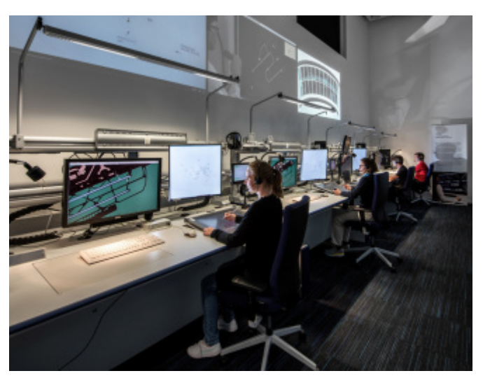
Air Traffic Management and Operations Simulator (ATMOS)