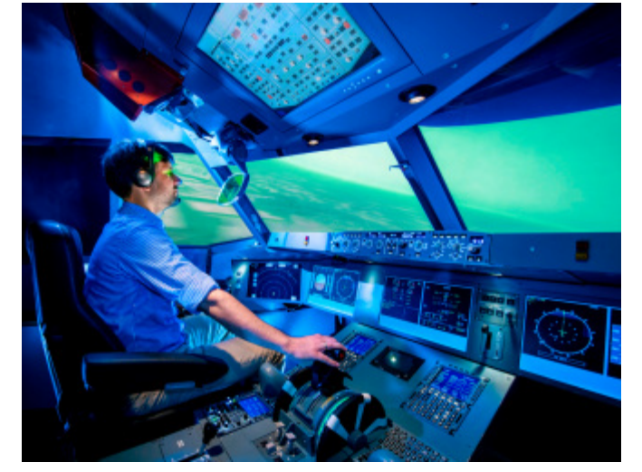
Modular fixed-base cockpit simulator GECO