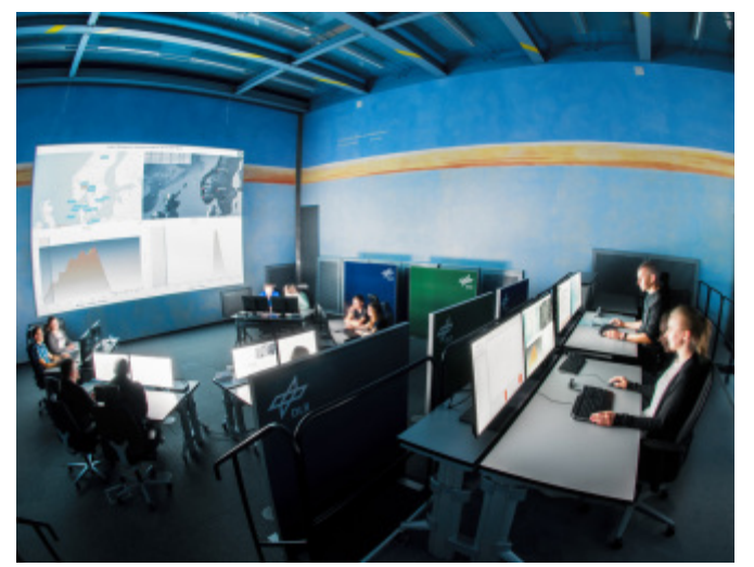
Airport and Control Center Simulator (ACCES)