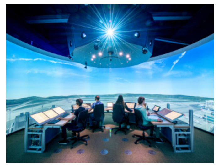
360° Apron and Tower Simulator (ATS)