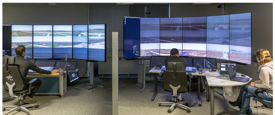
One controller (left) is handling the simulated airports Kaunas and Palanga while his fellow controller (right) deals with an emergency at Vilnius airport (lower third in the panorama)

Under which conditions is one air traffic controller able to provide high quality air traffic control to more than one airport simultaneously? To assess this key topic, the SESAR 2020 research project "PJ05 – Remote Tower for Multiple Airports," was started in 2016 as a part of the European Union's Horizon 2020 research and innovation programme. Coordinated by the DLR Institute of Flight Guidance, a group of 39 international partners carry out joint research activities covering technical and human factors topics.