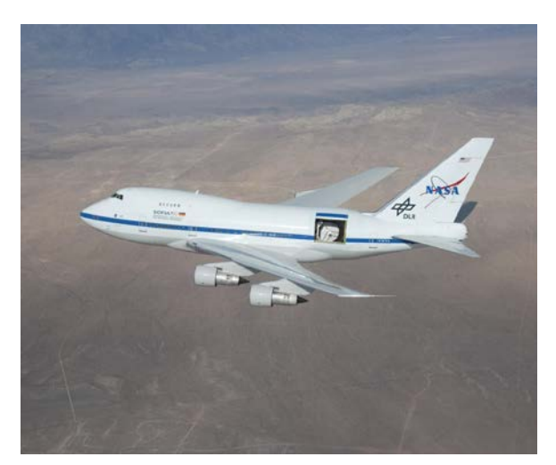
SOFIA test flight with open door and exposed telescope high above the Mojave Desert in southern California.

SOFIA offers frequent flight opportunities, easy to change state-of-theart instruments and hands-on training of young scientists. Thus a broad participation by the science-community is ensured. The flexibility of SOFIA also provides worldwide access to short-term observing targets of opportunity. Due to the relatively short times for instrument development SOFIA will offer an excellent test bed for future space missions.