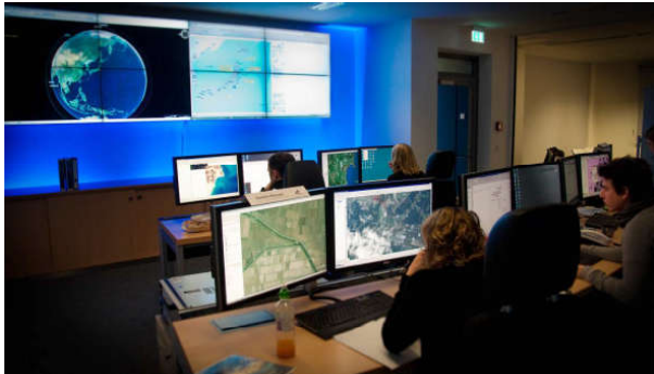
Urgent Decision Making at DLR's Center for Satellite based Crisis Information (ZKI).

The European-funded H2020 project VESTEC (Visual Exploration and Sampling Toolkit for Extreme Computing) will be completed in 2022 after a successful project duration of 3.5 years. At a two-day closing event, the international project partners from research and industry will present the software solutions they have developed for the assessment and management of acute crisis scenarios. Keynotes of domain experts will invite for intensive discussions. A panel will conclude the workshop. We cordially invite you to this online event.