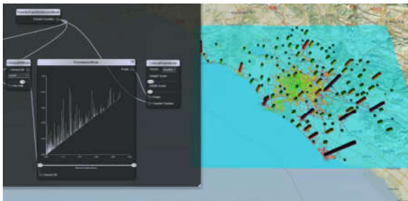
Geometrically lifted Persistence Diagrams depict Areas in the Rome Region of High Infection Risks based on R0 Simulation Data.