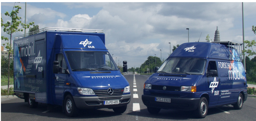
Fig. 4: DLR measuring vans are equipped with DGPS for positioning down to the decimeter

GLONASS is the Russian satellite navigation system. Its structure and manner of operation are comparable to the U.S. GPS system.