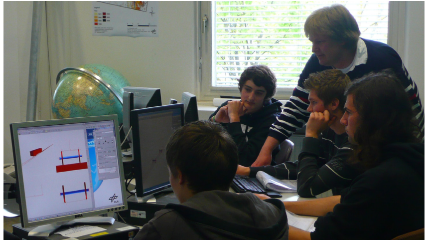
Fig. 2: Students creating a simulation

What does this sentence mean: "A good model is as simple as possible and as detailed as necessary?"